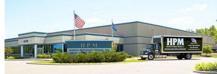
Modern 100,000 Square Foot Facility